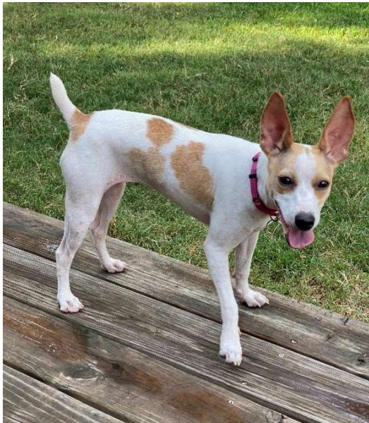
Current Houston Cares foster, Arwen (from Lord of the Rings)