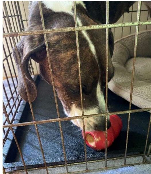
Houston Cares at PetSmart-West Loop, Saturdays from 11 AM to 2 PM